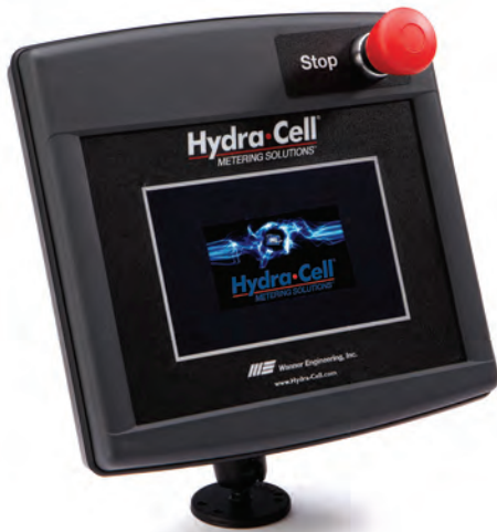
Opening screen - touch to activate.

and I/O module.) The 7-inch color graphic touch-screen user interface is provided in a NEMA-4X enclosure.