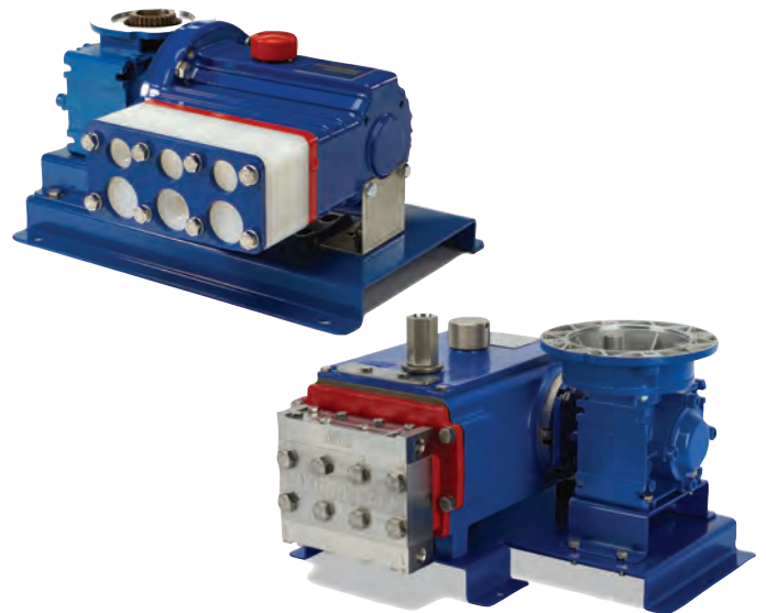
Control Freak is designed for Hydra-Cell Metering Solutions P Series pumps and the MT8 triplex pump.