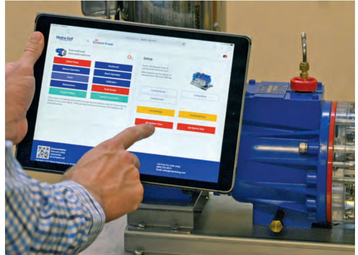
Web-based version operating from a tablet.

This versatile electronic controller allows programming for the flow rate or for totalization of the recent process application as well as the life of the pump.