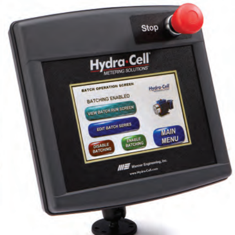
Sample menu for batch operation.