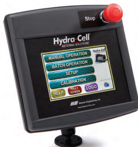
Start-up menu options.