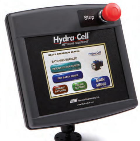
Sample menu for batch operation.

“Control Freak” can also be used for controlling motor speed with select Hydra-Cell bare shaft pumps used for metering.