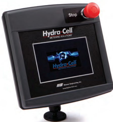
Opening screen - touch to activate.