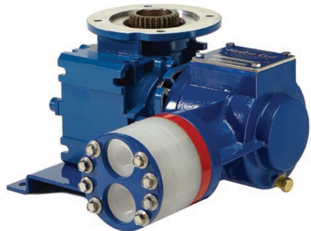
P100 with Polypropylene pump head

Due to the Wanner Engineering Continuous Improvement Program, specifications and other data are subject to change.