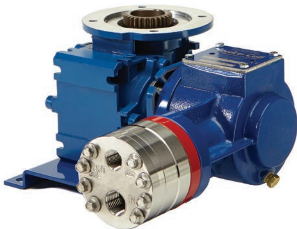
P100 with Stainless Steel pump head

*Note: Since the P100 is the only single-diaphragm pump model in the Hydra-Cell Metering Solutions P Series line, it is recommended that pulsation dampeners be used to achieve virtually pulse-free flow.